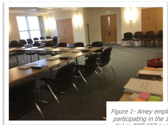
Figure 1- Amey employees participating in the 1-day Kelvin TOP-SET training course